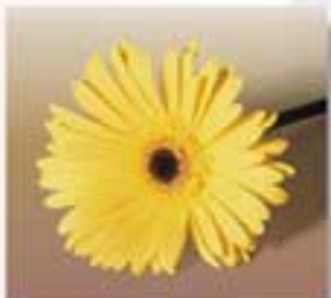
You can create a 24-bit image in a graphics program such as Paint.

number rather than by each color value number. The palette numbers are used to limit the amount of bits needed to describe each pixel. Although bit-mapped files can still be quite large, saving the values for each pixel takes only a couple of seconds. Here is how it works: