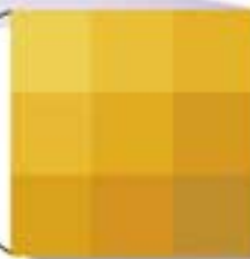
Each of the pixel's three-color values, RGB (red-green-blue), are read from left to right.